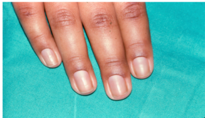
Left: Figure 2. Right Figure 3

A 16 year old girl was admitted to the hospital in coma and found to have profound hypoglycemia. Her physical findings were striking for pigmented patches on her tongue, gums, and lips and her skin was deeply suntanned (see figure 2 and 3). The mother related that her daughter has T1DM since age 12 and had been experiencing numerous hypoglycemic episodes unrelated to food intake or exercise. Accordingly, the dose of insulin had been reduced to about 50% of what it had been 3 months previously. She responded to glucose infusion and recovered full consciousness. Laboratory tests documented a marked elevation of ACTH, low morning cortisol, elevated antibodies to 21OH, and markedly elevated TSH with a low T4. Thus, this patient fulfills all criteria for APS2. The hypoglycemia was due to a combination of deficient hormonal counter-regulation (cortisol deficiency) as well as the delayed clearance of insulin as a result of hypothyroidism.